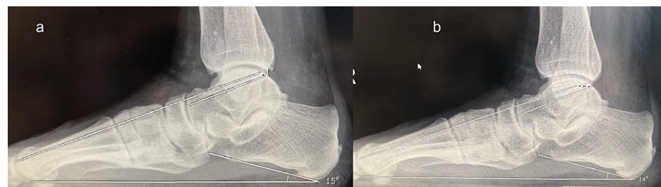
FIGURE 1: (a) Preoperative and (b) postoperative radiological images of the patient in group 1

The radiological results and FFI scores of both groups were measured before and after surgery and the difference between the groups was compared (Figures 1, 2). Then, the difference between the results of both groups was evaluated.